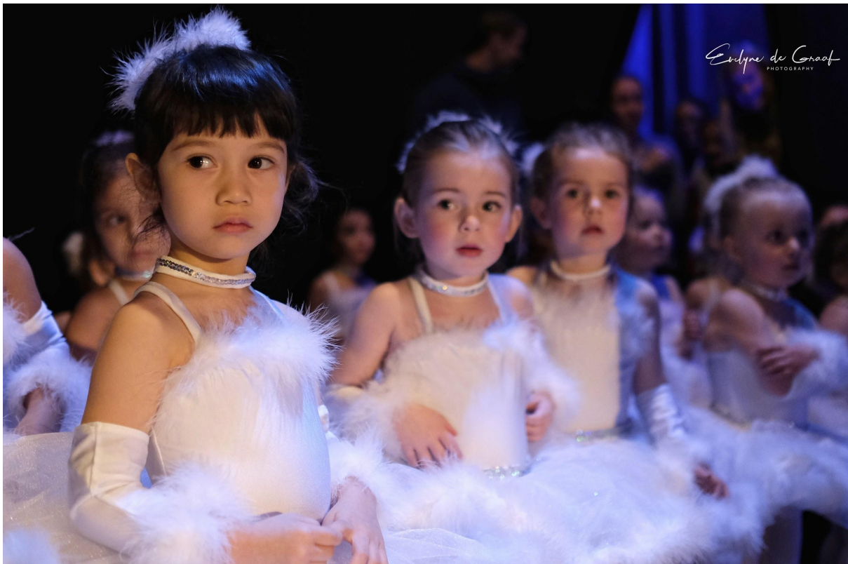
Piri Ballet's Frozen in Ballet at Theatre de Marens, December 2017

As we cannot guarantee that there will be a picture taken by our photographer of each and every child, we do not charge you for pictures. Pictures will be uploaded after the show and can be purchased by image.